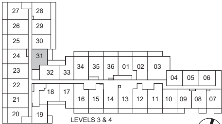
LEVELS 3 & 4