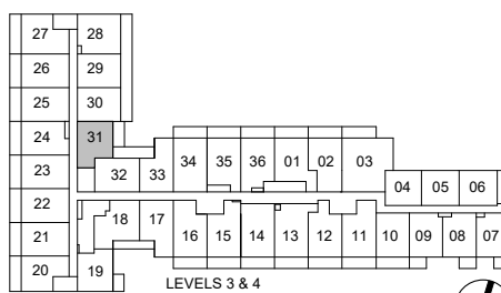
LEVELS 3 & 4

This plan is not to scale and subject to architectural review and revision including without limitation, the Unit being constructed with a layout that is the reverse of that set out above. All materials, specifications, details and dimensions, if any, are approximate and subject to change without notice in order to comply with building site conditions and municipal, structural, Vendor and/or architectural requirements. Actual usable floor area may vary from the stated floor area in accordance with the Floor Area Calculations Directive dated February 1, 2021 published by the Housing Construction Regulatory Authority. Location of structural and mechanical elements may vary from what is shown. Bulkheads are not shown on this plan and may be located in areas of the Unit as required to provide venting and mechanical systems. Balconies, Terraces and Patios if any are exclusive use common elements, shown for display purposes only and location and size are subject to change without notice. Window location, size and type may vary without notice. Suites sold unfurnished. QAL201809171FS 20200202 E. & O.E.